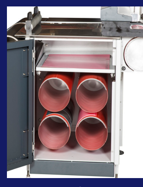
Internal store for raw mounted or ready for print sleeves